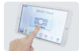
Wireless control with tablet