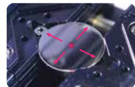
Laser pointer for pointing to the area of engraving