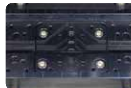
A vise for easy fastening of various shapes/sizes